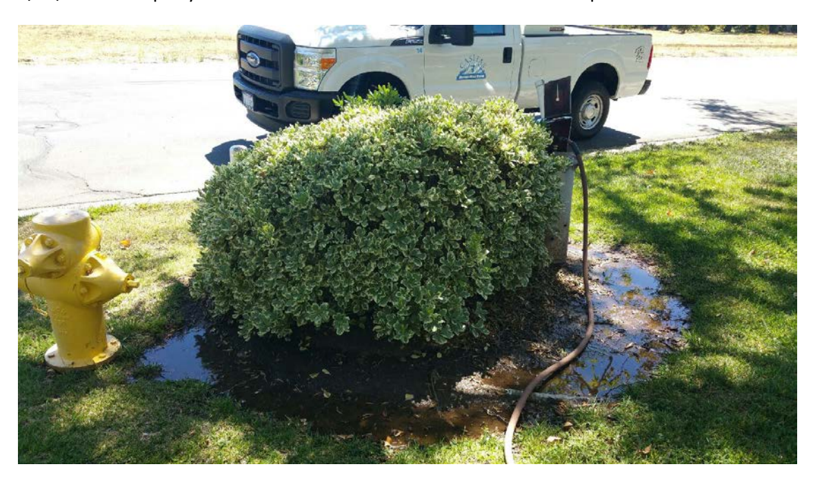
7/20/2016 – Property Owner's hoses running from Water Sample Station to Property Owner's front yard