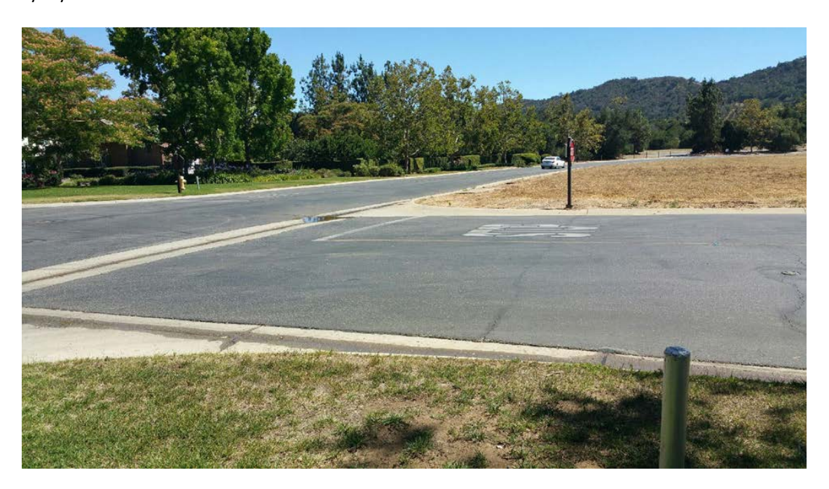
7/20/2016 - Casitas Water Sample Station – Cut back strap to gain unauthorized access to water

Incident Photos - 7/20/2016 - Water Waste, Theft, Facility Damage – 12219 MacDonald Drive 7/20/2016 - Water Waste at intersection of MacDonald Drive and Shokat Drive